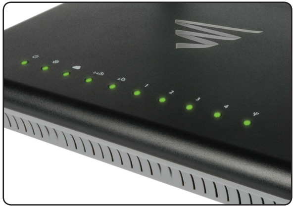
XWR-1200 Front Panel View